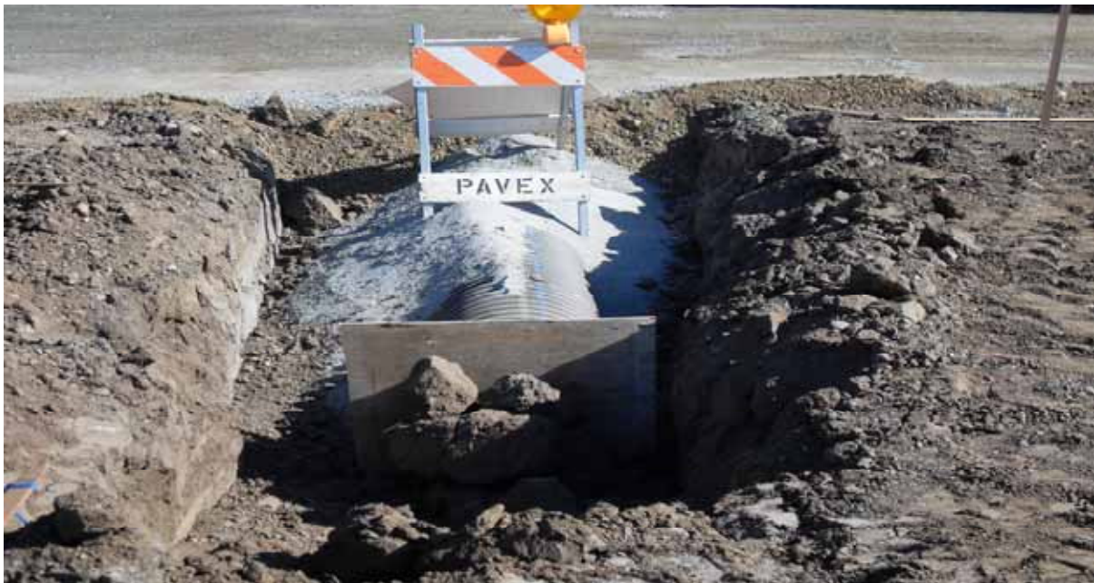
• Drainage System at Hudner Ln.