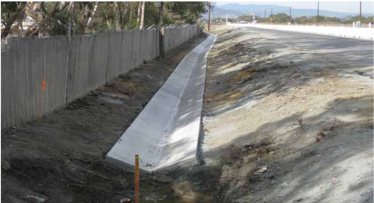
Minor Concrete at Tri Cal Lined V Ditch