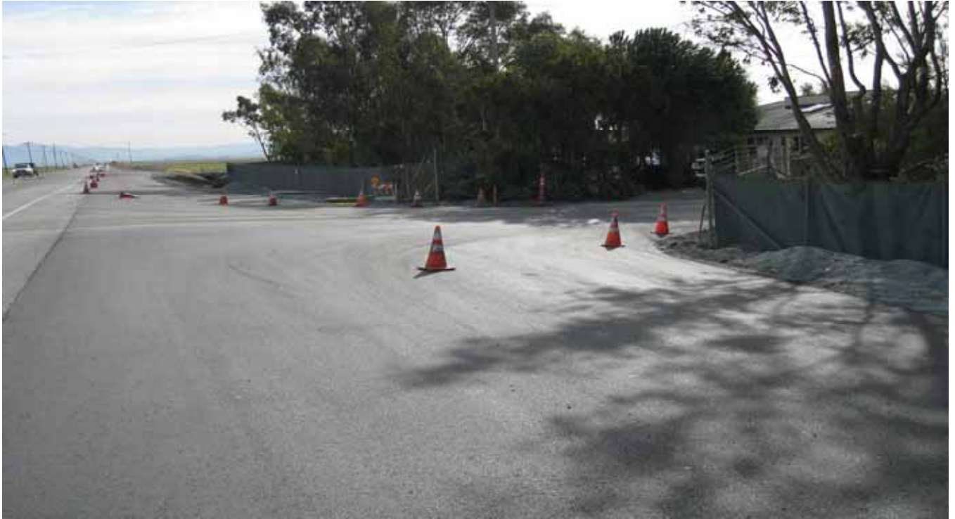
Widening at Tri Cal Chemical Yard