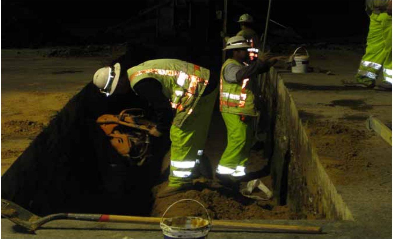
Pavex Installing Drainage System at Tri Cal Chemical Yard crossing Hwy 25