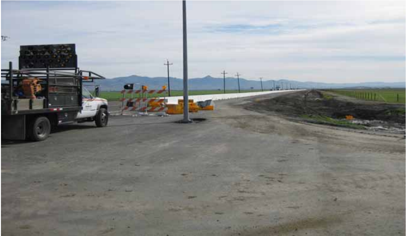
Widening at Shore Rd.